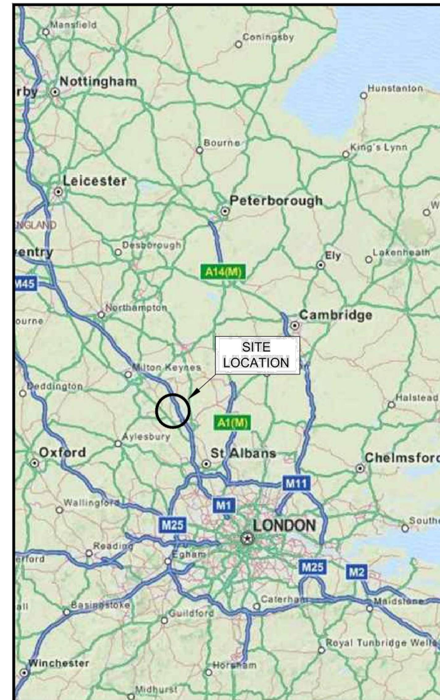
Location Plan Scale NTS